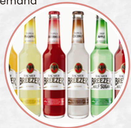
BACARDI BREEZER BAR