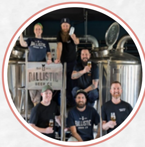
BALLISTIC BEER BAR